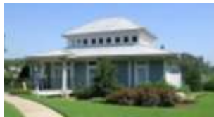
Selected by Lake Sovereign HOA To paint the Clubhouse, Cabana & Gazebo